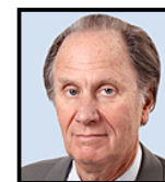
David Bonderman Founding Partner TPG Capital