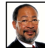
Richard D. Parsons Senior Advisor Providence Equity Partners LLC; Former Chairman, Citibank; Time Warner

For A Detailed Event Profile and Agenda CLICK HERE