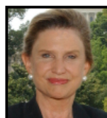
Carolyn Maloney Member of the U.S. House of Representatives New York 12th District