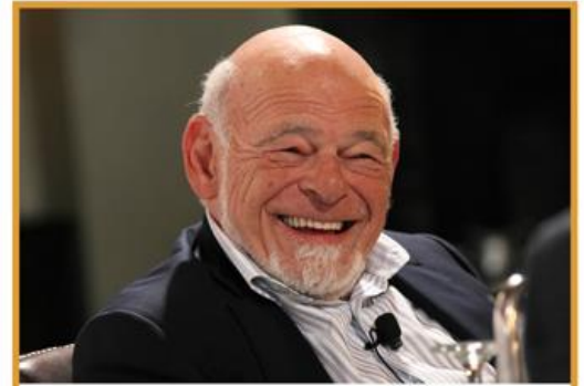
Sam Zell, Chairman, Equity Group Investments (and the creator of the REIT) at the 2013 Emerging Leaders Summit sharing his vision for the need to increase philanthropic giving to educational institutions