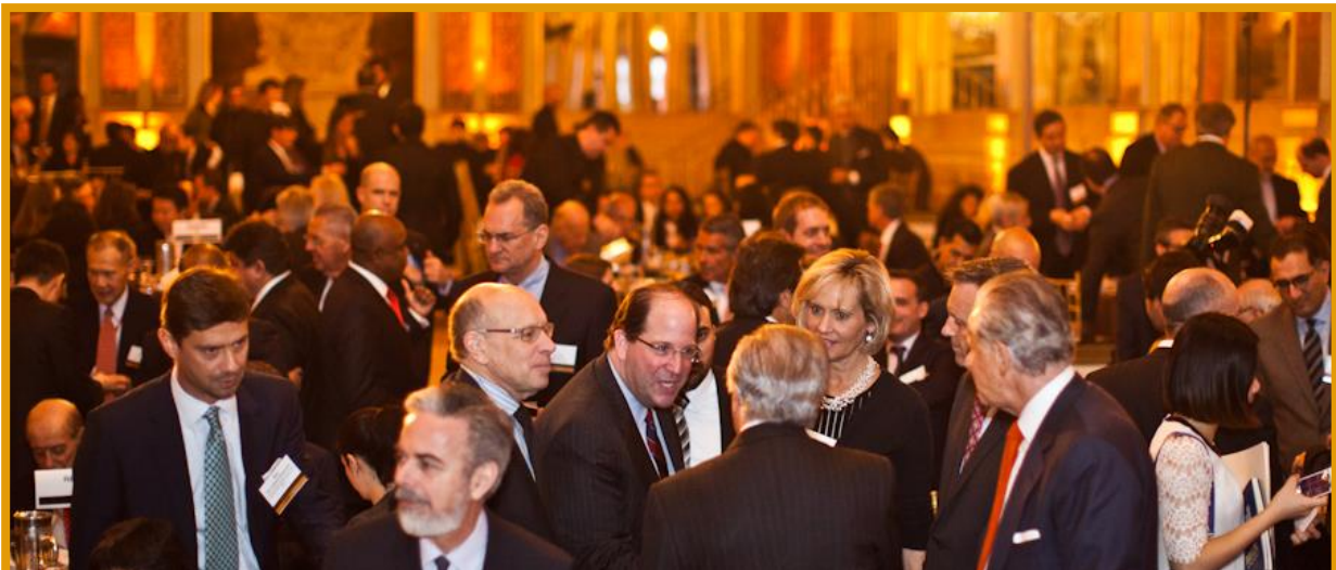
Brazilian Vice President Michel Temer and Ambassador Antonio Patriota at The M&A Advisor's 2014 International Financial Forum (New York)